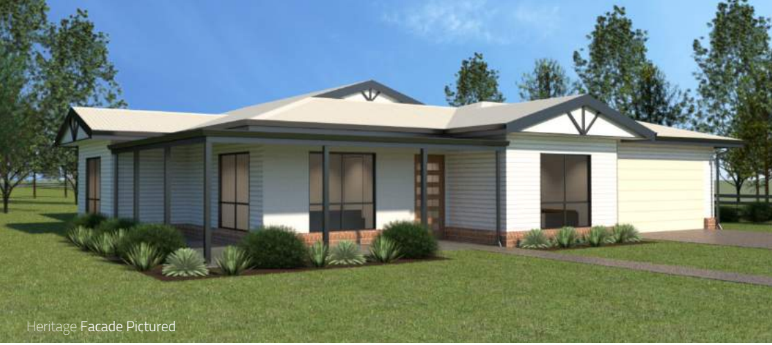
Heritage Facade Pictured