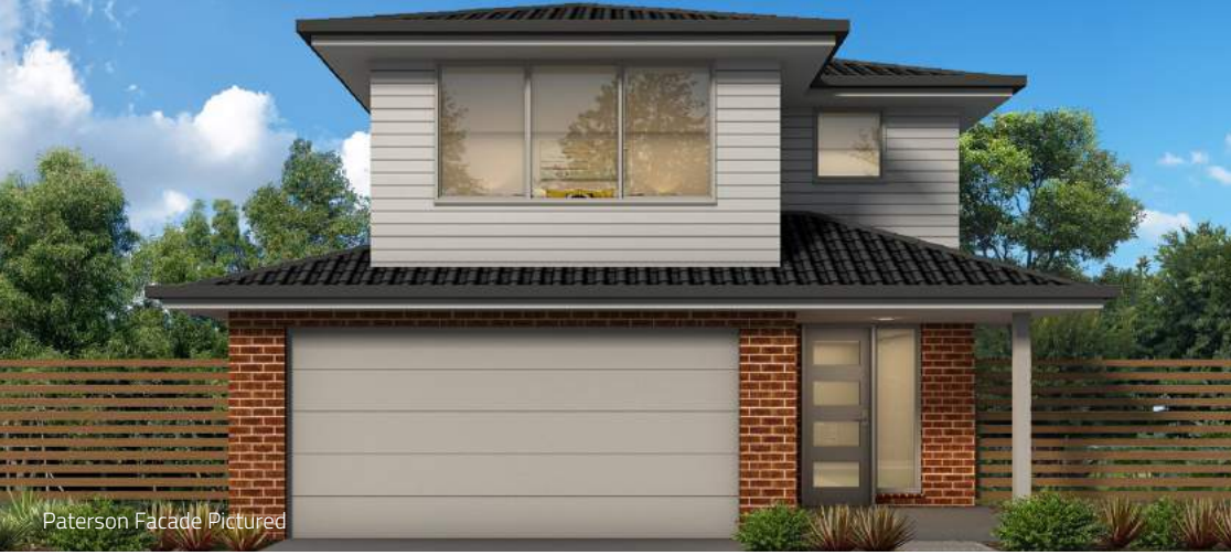
Paterson Facade Pictured